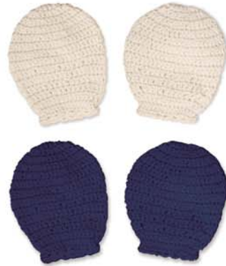
Baby Mittens (w/voile lining) (ecru) AVB-Ac04-01C (navy) AVB-Ac04-01CN