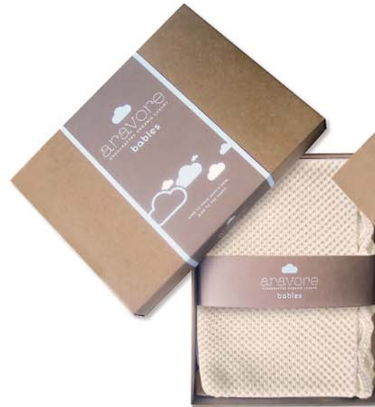
Receiving blanket (ecru) AVB-B01-01