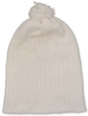
Pompom hat (ecru) AVB-Ac02-02