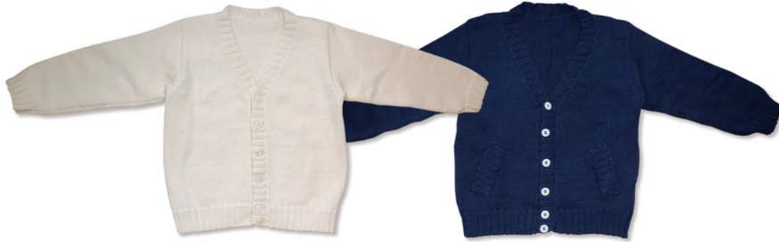
Plain unisex cardigan (con escote V) ecru AVB-C01-08C