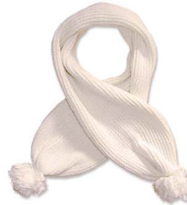
Baby scarf pompom (ecru) AVB-Ac01-02