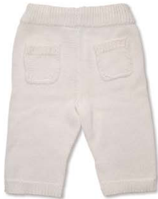
Trousers w/ back pockets (ecru) AVB-P01-C