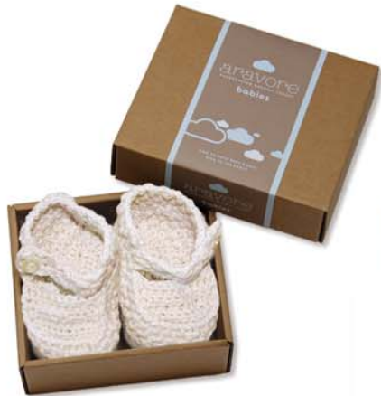
Knitted shoes (ecru) AVB-Ac03-04C