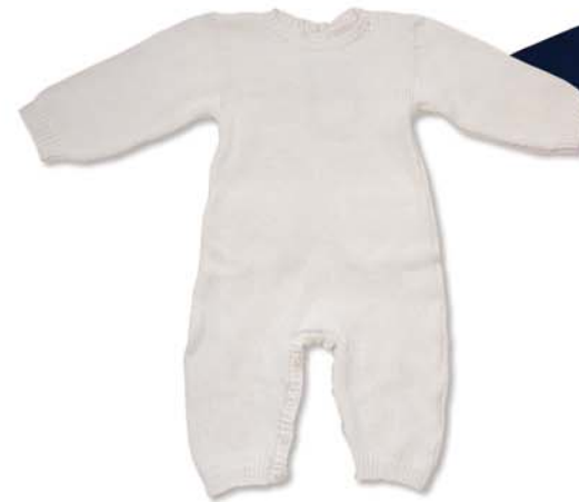
All in one w/ back pockets (ecru) AVB-TL-01C