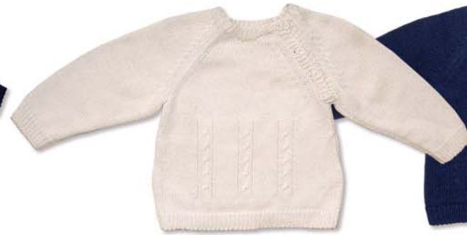
Round neck jumper (ecru) AVB-C02-05