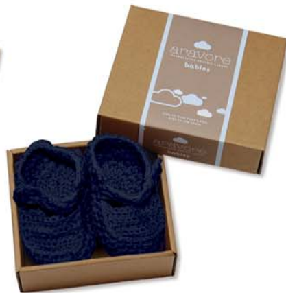
Knitted shoes (navy) AVB-Ac03-04CN