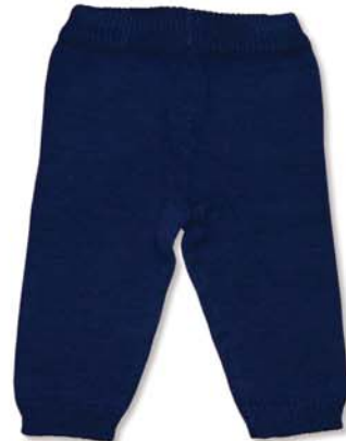
Trousers w/ back pockets (navy) AVB-P01-NC