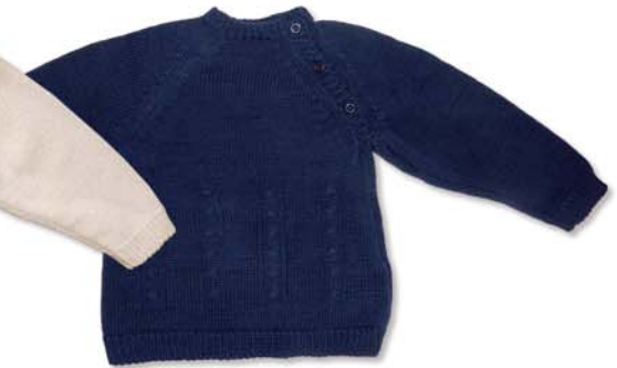
Round neck jumper (navy) AVB-C02-05 NC