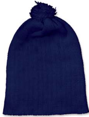
Pompom hat (navy) AVB-Ac02-02CN