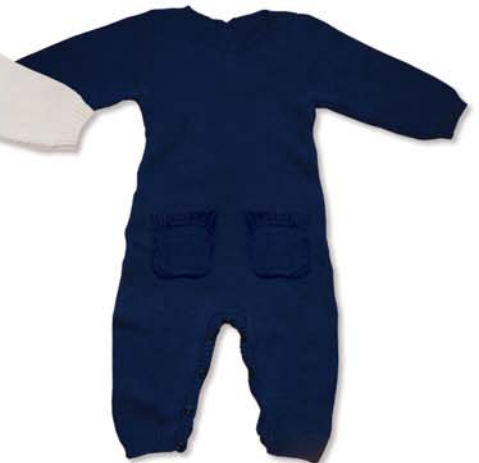
All in one w/ back pockets (navy) AVB-TL-01NC