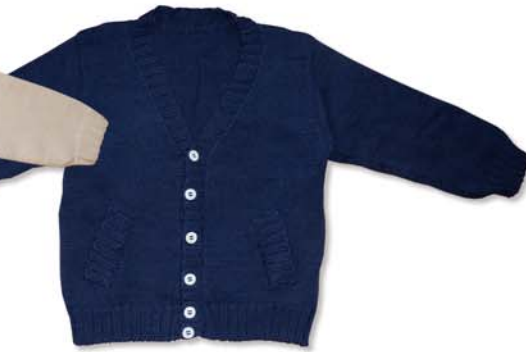
Plain unisex cardigan (con escote V) navy AVB-C01-08CN