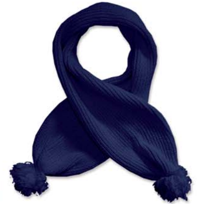
Baby scarf pompom (navy) AVB-Ac01-02CN