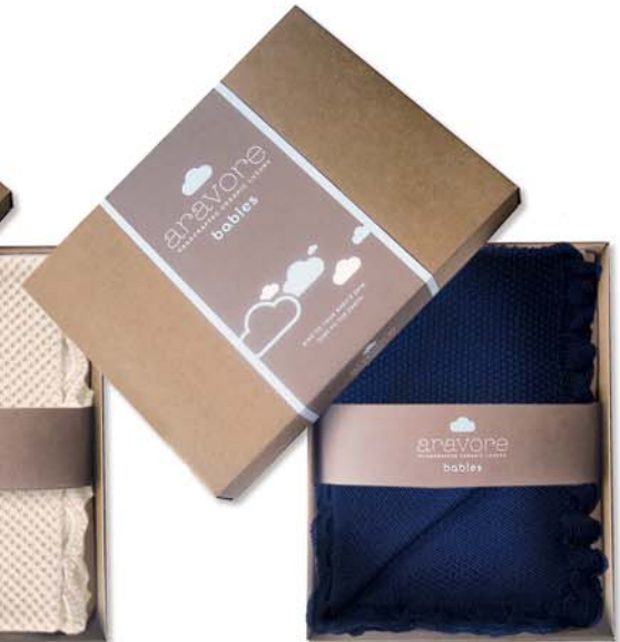
Receiving blanket (navy) AVB-B01-01CN